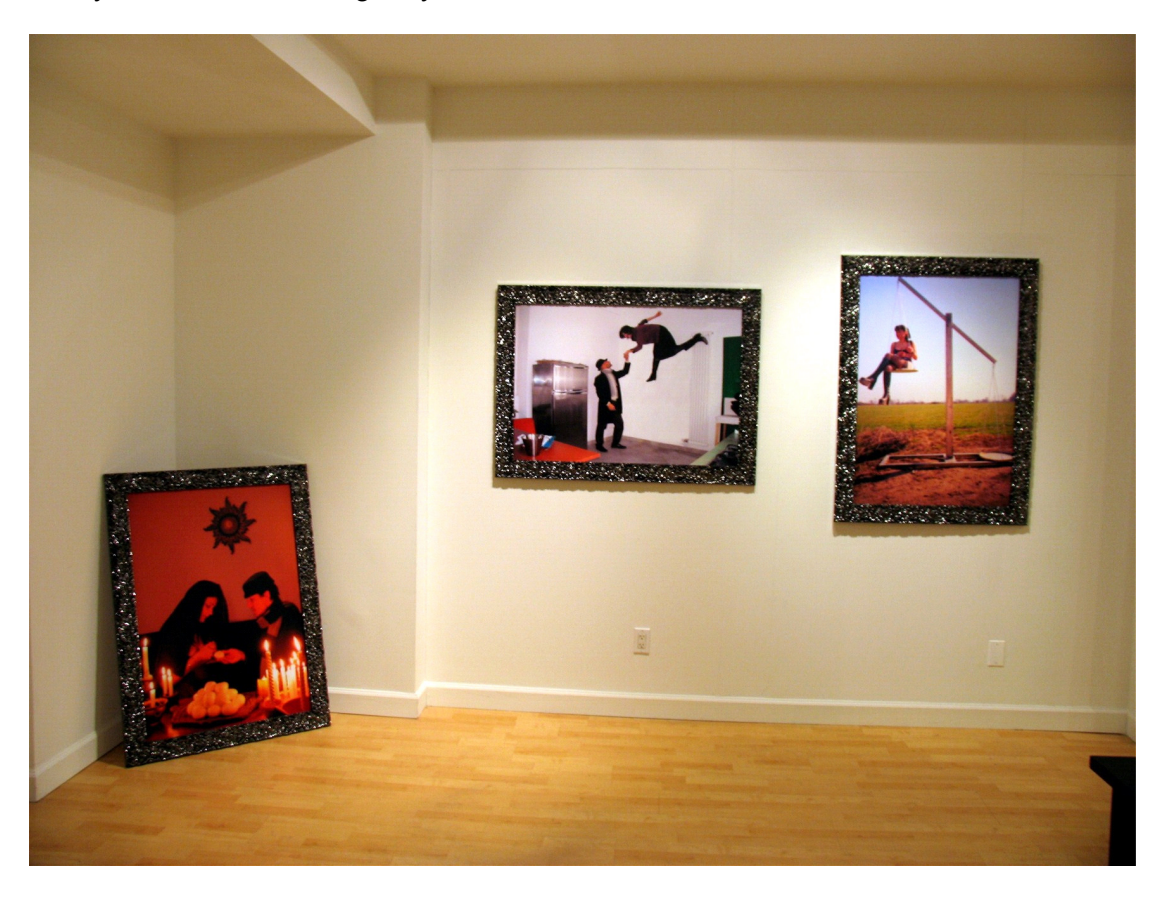
DIGITAL WORKS: The Madonna of mozzarellas (2000), Anele (2008), Mary with child (2000)