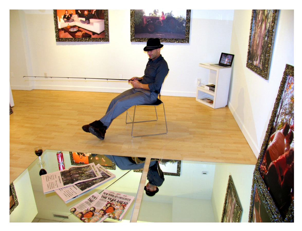
PERFORMANCE: Fishing New York (january 9, 2013)