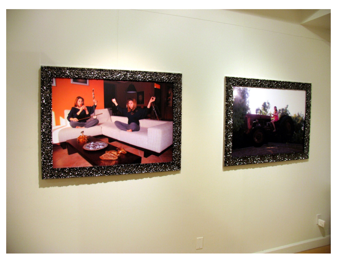
DIGITAL WORKS: 77 (2009), The farmer (2012)

Magrin's art emerges out of the need to present first and foremost, the breathing visual incarnation of aesthetic intuition. This involves an intense concentration on the part of the artist to balance conscious and unconscious activity, drawing upon a power-not-itself, and combining the real and the ideal. The artist veers away against sanctioned thinking, against the canons of established religion, rules of the state, against academic art and sanctioned views of sexuality.