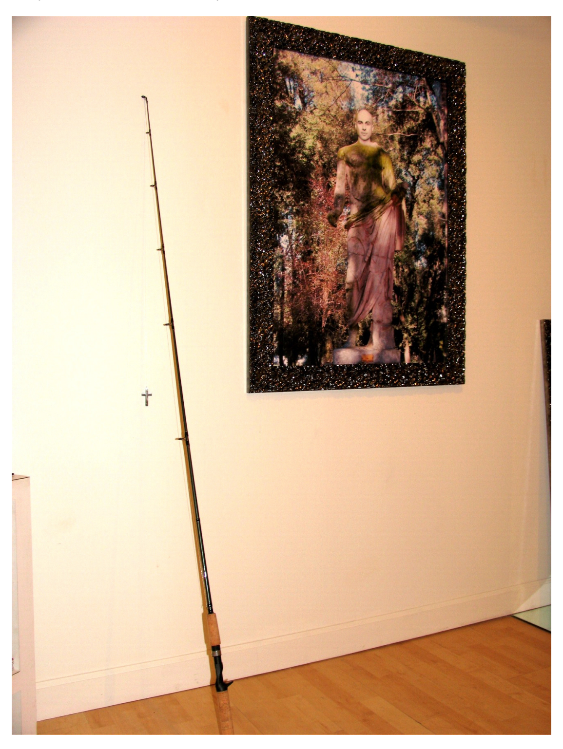
DIGITAL WORK AND ISTALLATION: Civis Romanvs (2008), Fishing New York (performance january,9 2013)

On the one hand, we can see elements that are modern in content but traditional in execution, such as explorations of the divided and shattered psyche, responses to interior states responding to exterior stress. These images, seemingly, at a delicate remove from the sturm und drang of the roiling soul in distress. They are rooted in a romantic inquiry in the role of cosmic forces as they direct man's inner and outer life away from the known and the representable.